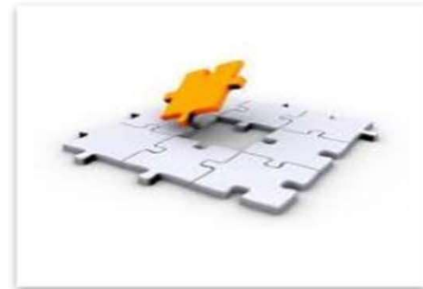
Value Added Services

An ISO 9001:2015 & OHSAS 45001:2018 Certified Company