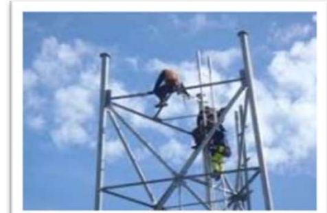
Installation and De-Installation of Telecom Equipments