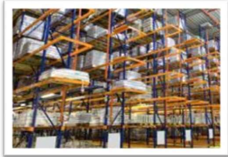
Warehouse & Inventory Management