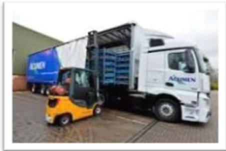
Distribution Management Services