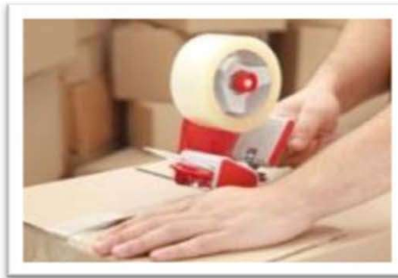
Kitting & Packaging